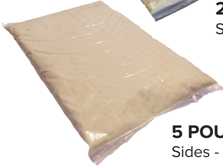
5 POUND BAG Sides - about 18 servings