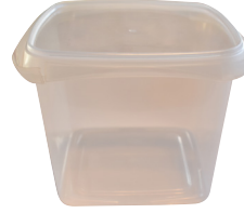
3 POUND Salads - about 11 servings