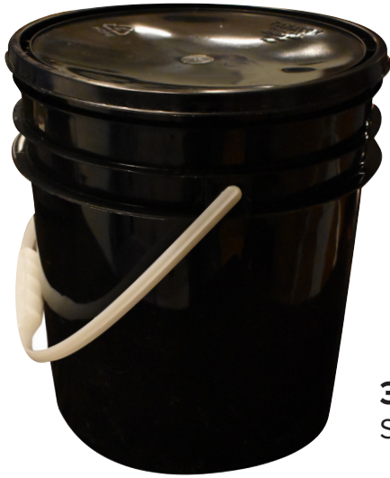
35 POUND Salads - about 130 servings