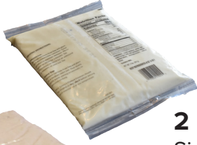
2 POUND BAG Sides - about 6 servings