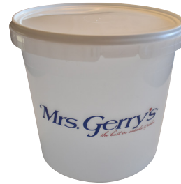
5 POUND Salads - about 19 servings Beans - about 17 servings Desserts - about 17 servings Proteins - about 22 servings Dips - about 76 servings