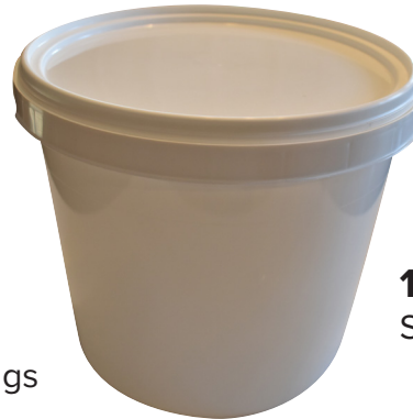
13 POUND Salads - about 48 servings

Effective January 1, 2023, sesame is being added as the 9th major food allergen. Mrs. Gerry's does not have any products that contain sesame.