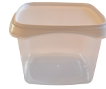
1 POUND Salads - about 3 servings